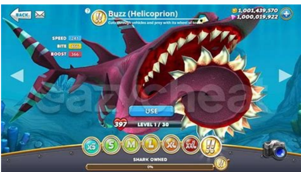
How to cheat on hungry shark world.